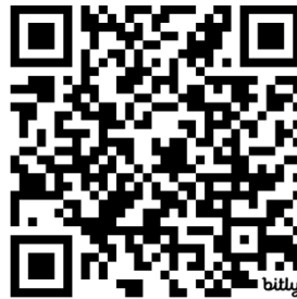
St. Michael's website