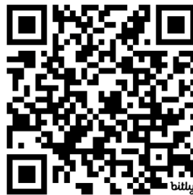
St. Michael's website