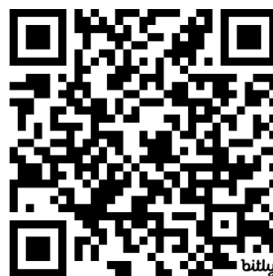
St. Michael's website