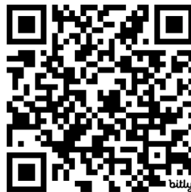
St. Michael's website