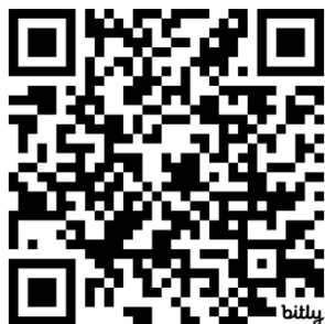
St. Michael's website

One-time gift or pledge, please scan one of these QR codes to make a secure, private donation.