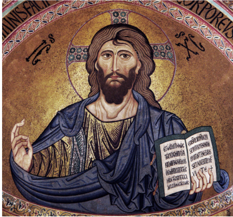
Christus Pantocrator, Cathedral of Cefalù, c. 1130

The Holy Eucharist ❖ October 31, 2021 ❖ 9:00 am